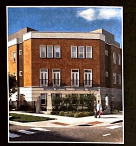
University Village Row Homes offers variety of styles. See page 12.